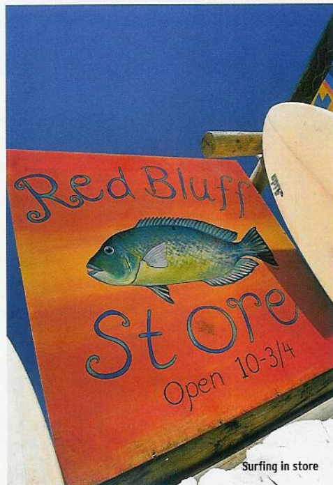
Surfing in store