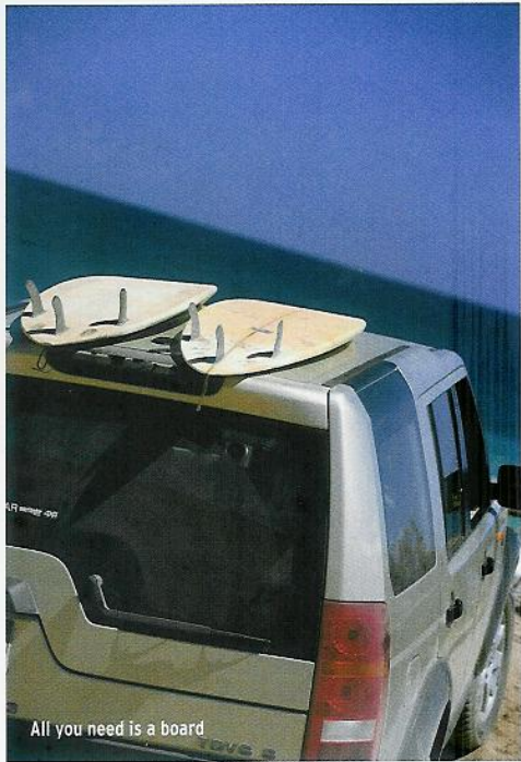
All you need is a board