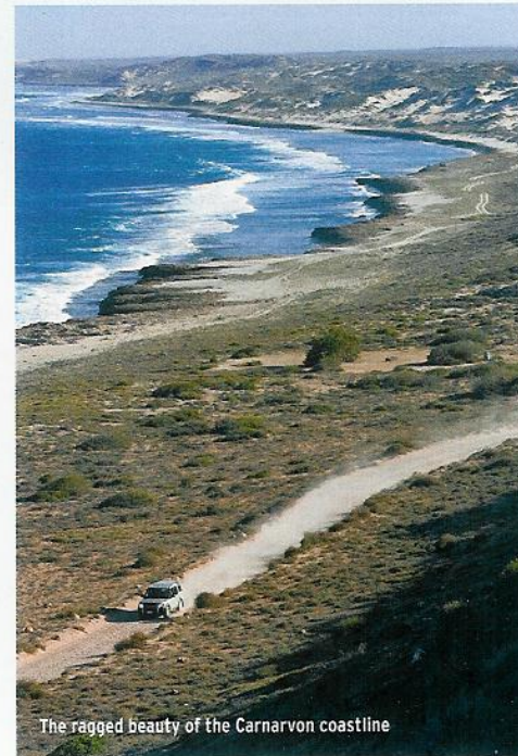
The ragged beauty of the Carnarvon coastline