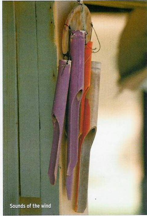
Sounds of the wind