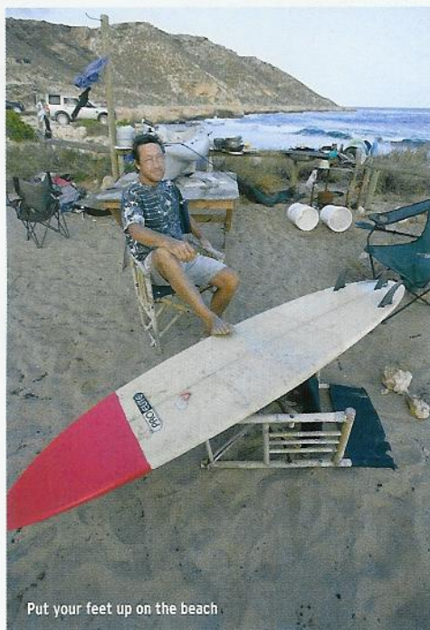
Put your feet up on the beach